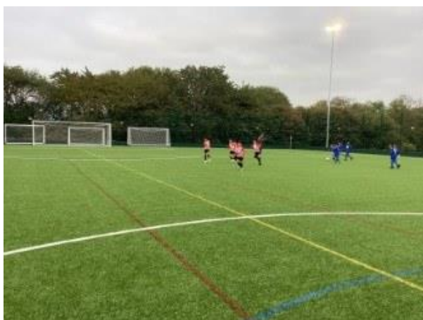
1 - Well done to our footballers!

As we come to the end of our first half term of the new year and indeed my first half term as your new Head of School, I would like to thank you for your support in getting the children back to school and settled into their new classes.